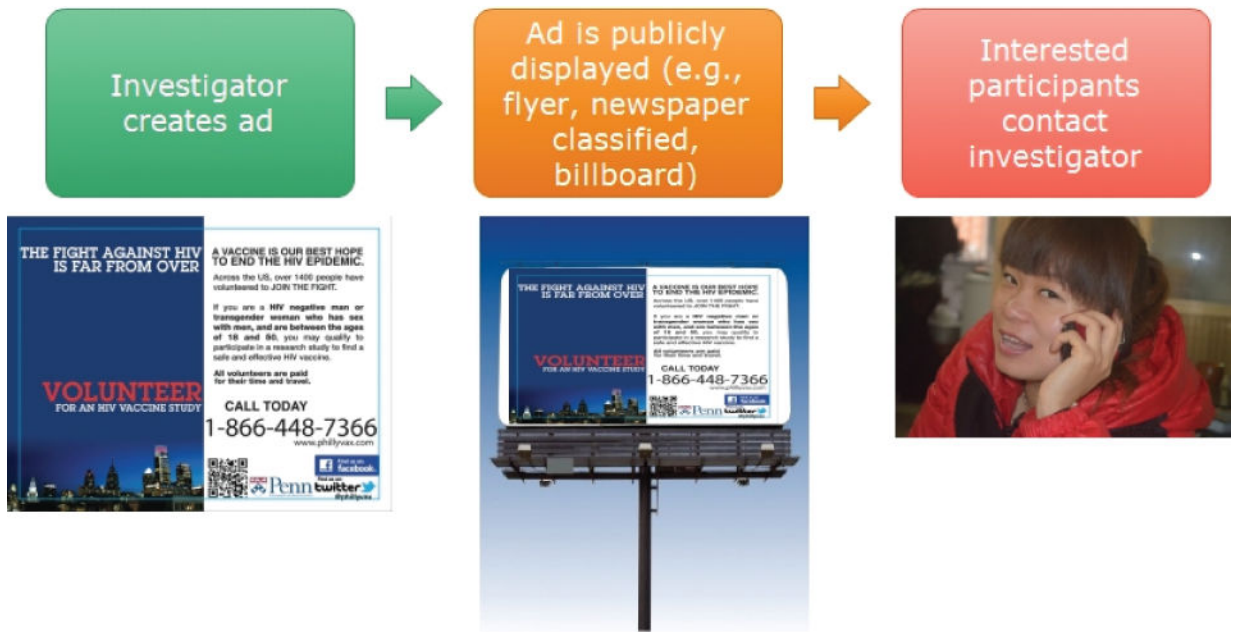
Fig. 1. Example of a Traditional Recruitment Advertising Transaction.